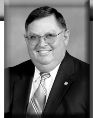
Melvin Duran Mayor of Priceville